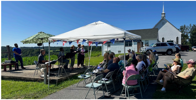
The praise band opened with song...