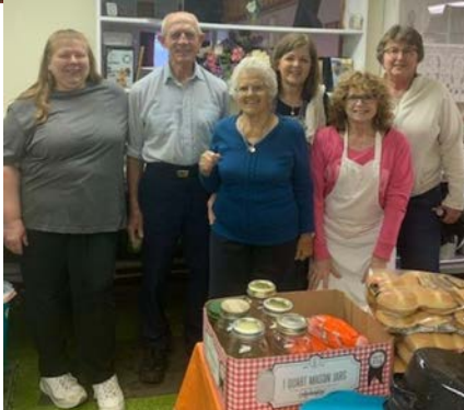
The kitchen crew