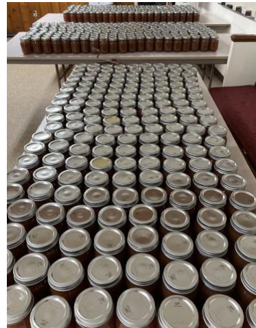
Behold! The finished product!

660 pints of apple butter were prepared and available for sale. Thank you to New Beginning Nazarene Church for all their help!